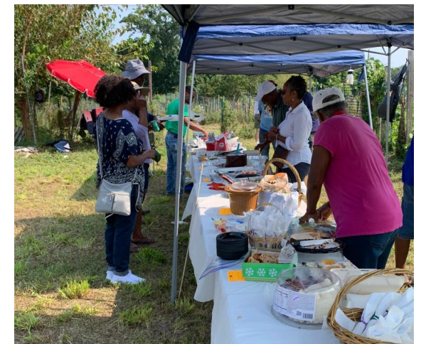
Gardeners enjoy a potluck at the community picnic in September 2022.

Remember that as you sign your Permit Agreement, you are agreeing to be an active part of our community. It's never too early to start—contact the board to support an upcoming project.